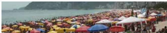
SOUTH AMERICA 1 - 19 October, 2010 Visit Rio De Janeiro & Buenos Aires, gardens of Burle Marx. Discover Patagonia in Bariloche. Experience Igassu Falls.