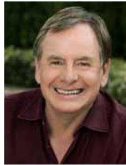
Graham Ross - Celebrity Gardener Better Homes & Gardens TV Show The 2GB Garden Clinic Radio Show

To celebrate our 30 th year, one rare black pearl, valued at $1000 from Blue Lagoon Pearls, Western Australia, will be presented to one lucky traveller on each of our international tours in 2010.