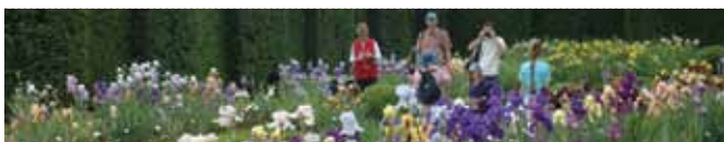
FRANCE 3 - 21 June, 2010 Flower gardens of France incl. Monet's Giverny, Versailles & Bagatelle. Good food, wine & beauty of the Dordogne & the Lot.