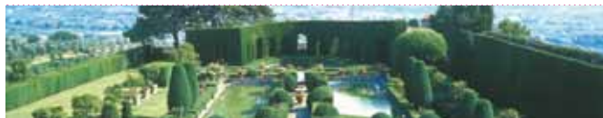
ITALY 23 September - 10 October, 2010 Gardens of Tuscany & the Italian Lakes. Rome, Venice and the best Renaissance gardens of Italy.