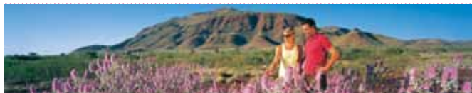
WESTERN AUSTRALIA 17 August - 5 September, 2010 Enjoy the wildflowers on the Kalbarri coast, the Kimberley, the Pilbara & Mt Augustus. Cruise Shark Bay & Monkey Mia.