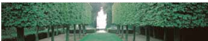
ENGLAND 23 May - 6 June, 2010 See the Chelsea Flower Show on Members' Day. Visit the best gardens in England including Sissinghurst and Hidcote.