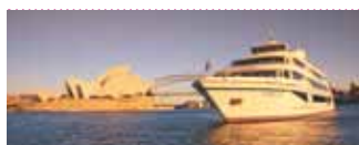
SYDNEY HARBOUR MOTHERS DAY CRUISE 9 May, 2010